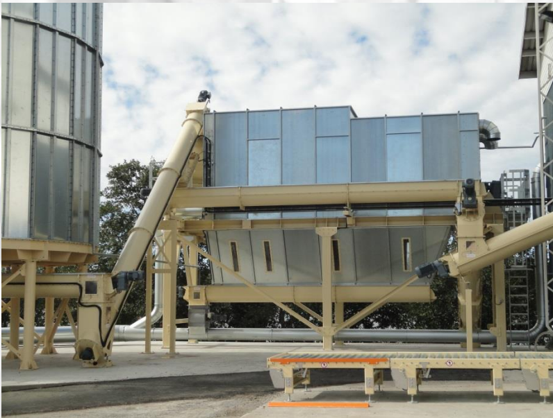
For transporting bulk products from A to B.