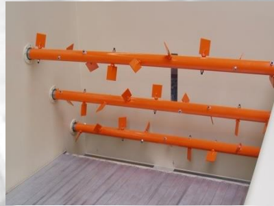
For buffering and dosing product.