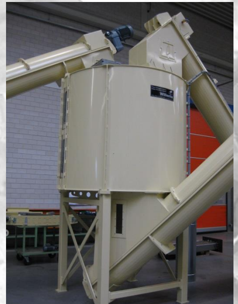
For buffering product.