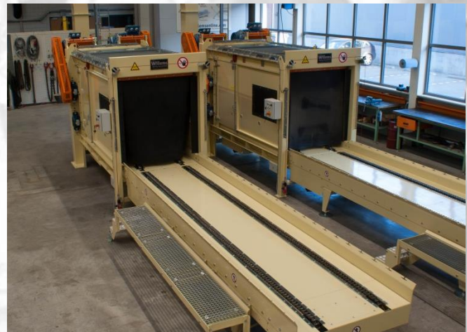
Chain conveyor with bale breaker for big bales.