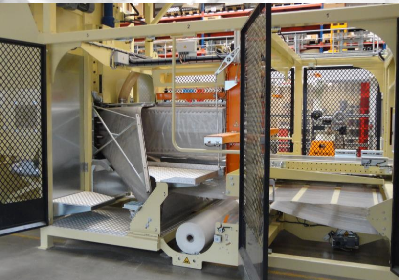
Packaging out of flat foil