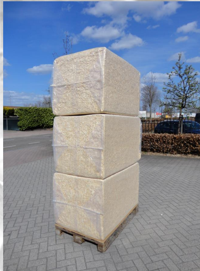
Bales stacked on a pallet

Ca. 150-180 kg (depending on bulk density and compression ratio).