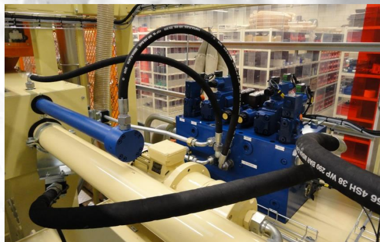
Hydraulic compression system