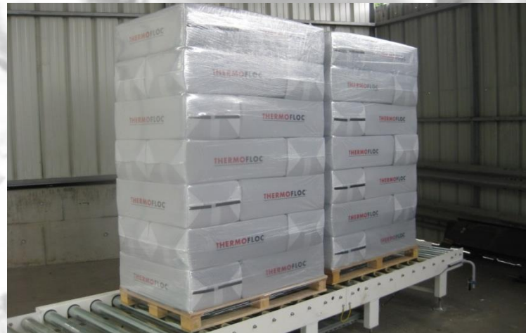
Bales stacked on a pallets