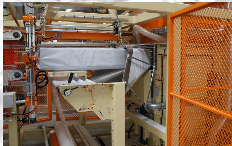
Packaging out of flat foil