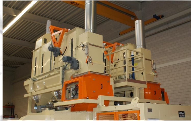
Hay dosing system