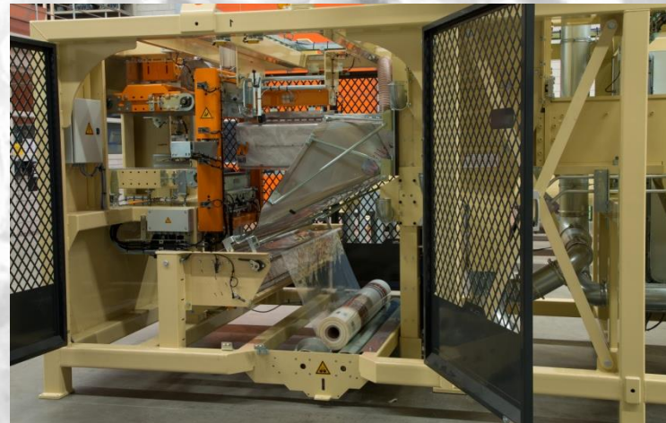
Packaging out of flat foil