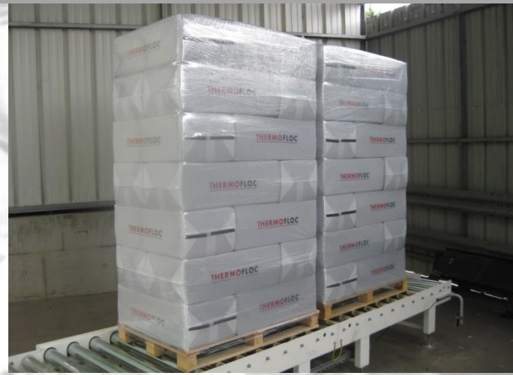
Cellulose bales on a pallet

10 up to 35 kg (depending on bulk density and compression ratio)