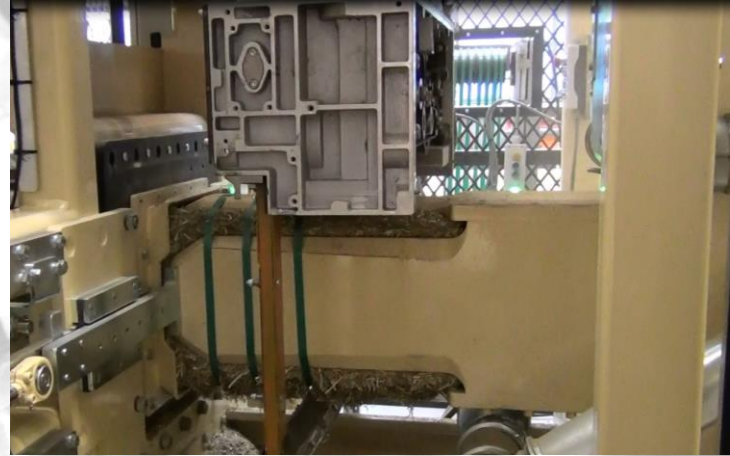
Straps for holding the high compressed bale together

9000 x 3250 x 6000 mm.(LxWxH). 354" x 127" x 236" (LxWxH).