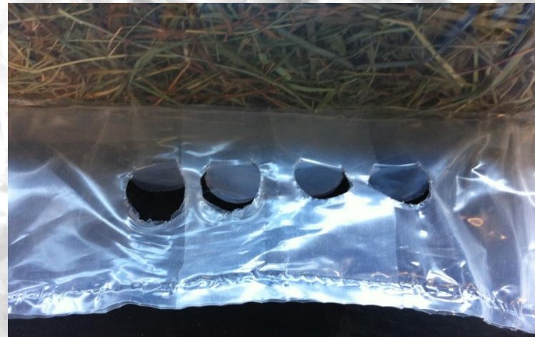
Handgrip on top side of the bale.