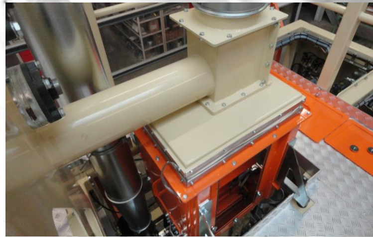
Dosing auger and weighing hopper