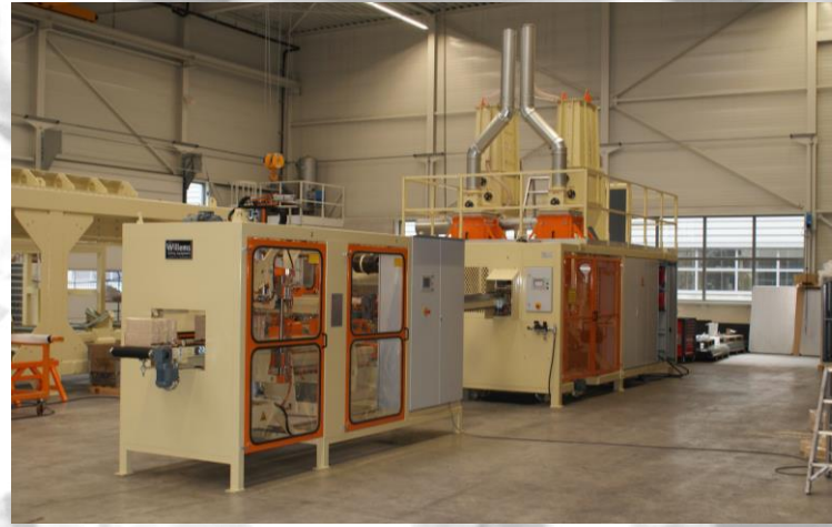
Baler and bundling machine